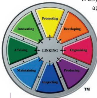
Types of Work Wheel

When the Office Manager suggested they review their processes using Team Management Systems, the team leader said: ‘We don’t need any psycho-babble. Just tell us if there is anything we could be doing better.’ This provided an ideal opportunity to apply the Team Performance Profile (TPP) . This team-based 360° diagnostic tool uses the Types of Work Wheel to identify the various priorities and perceptions of group effectiveness from within and outside the team.